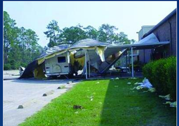
▲ Roofing and insulation material was blown off this building in Newton ISD, causing damage to a vehicle.